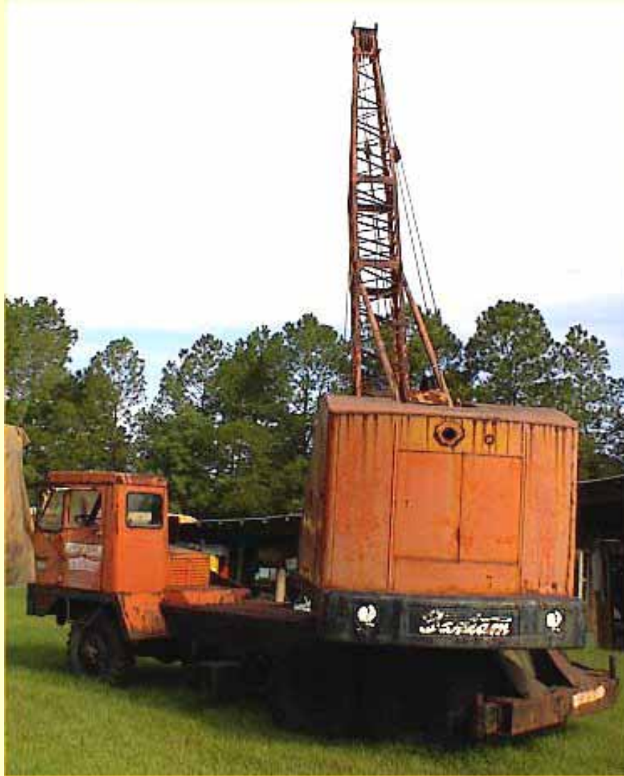
Truck mounted crane with non telescoping boom.